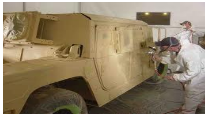
Figure 3. Corrosion Prevention in tactical wheeled vehicles

Plus, the Army is providing CPC training support to the Army National Guard (ARNG) and Army Reserve, developing interactive multimedia instruction for corrosion control inspection on tactical wheeled vehicles, and creating stronger partnership with the National Association of Corrosion Engineers (NACE) in order to provide free corrosion refresher courses at various Army installations. 34 Other on-going initiatives are cost benefit analysis studies, the development of new tactical wheeled vehicle publications, Lean Six Sigma (Black Belt effort) incorporating corrosion technology demonstration project, and preparing congressionally directed annual reports. 35