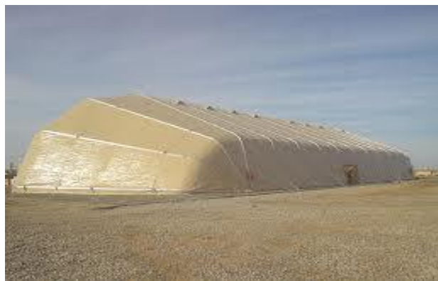
Figure 2. Large Area Maintenance Shelters

Currently, the Army CCPE is establishing several initiatives in order to improve corrosion prevention and control. For instance, the Army CCPE is also encouraging the tactical wheeled vehicle maintenance community to work together even more closely, since this is vital for effectively preventing corrosion. 28 In addition, the Army initiated a Silica-Based Chemical Agent Resistance Coating (CARC) Replacement for the tactical wheeled vehicles. 29 The replacement will strengthen the quality of topcoats, to have greater mar resistance and flexibility, resulting in better color and gloss retention and an overall longer life-cycle. Beyond that, multiple Controlled Humidity Protection systems were installed on Large Area Maintenance Shelters (LAMS) in some Army installations. 30 Under this project, dehumidified air is pumped into LAMS or equipment to reduce the rate of corrosion. The goal is to significantly reduce operational tempo cost and increase effectiveness.