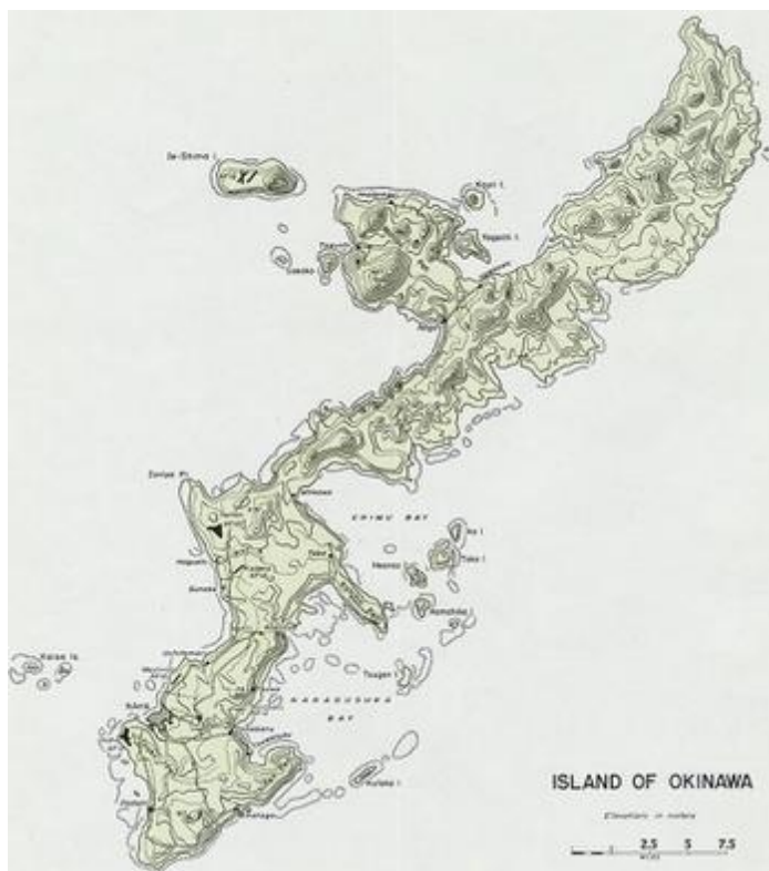
Figure 4. Geography of Okinawa.